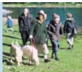
Countryside Agency / Rob Pilgrim