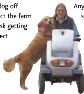
Kennel Club / Dogs for the Disabled

This can happen if farm animals have young, or have been worried by dogs in the past. If chased, it's safer to let your dog off the lead to get away and distract the farm animal away from you. Don't risk getting seriously hurt by trying to protect your dog.